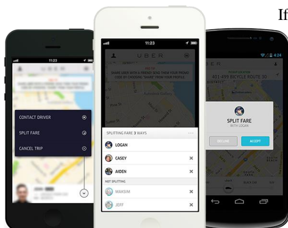
Phone 1 Phone 2 Phone 3

Uber offers additional features on the application to provide a more convenient and safer ride. One feature Uber offers is the option to split the fare of the Uber ride with additional passengers.