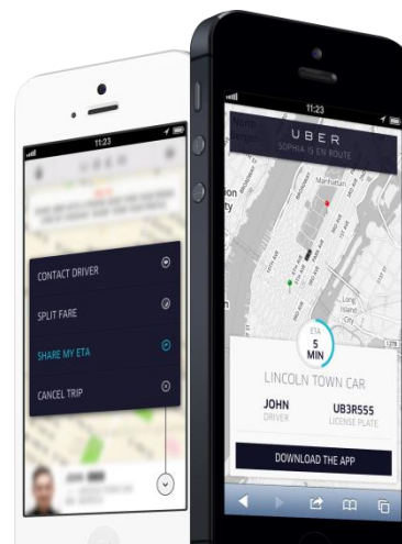
Phone 1 Phone 2

If there are a group of friends sharing an Uber, the app offers an option to equally split the fare amount. In Figure 2 there are three phones exhibiting the split fare feature. On Phone 1 there is a dark grey menu popped up giving the option to click "SPLIT FARE." The next step is to pick the people that the rider will be splitting the fare with. This is shown on Phone 2 . Phone 3 then displays the notification to accept the split fare offer. This feature allows a lower cost for a ride and convenience.