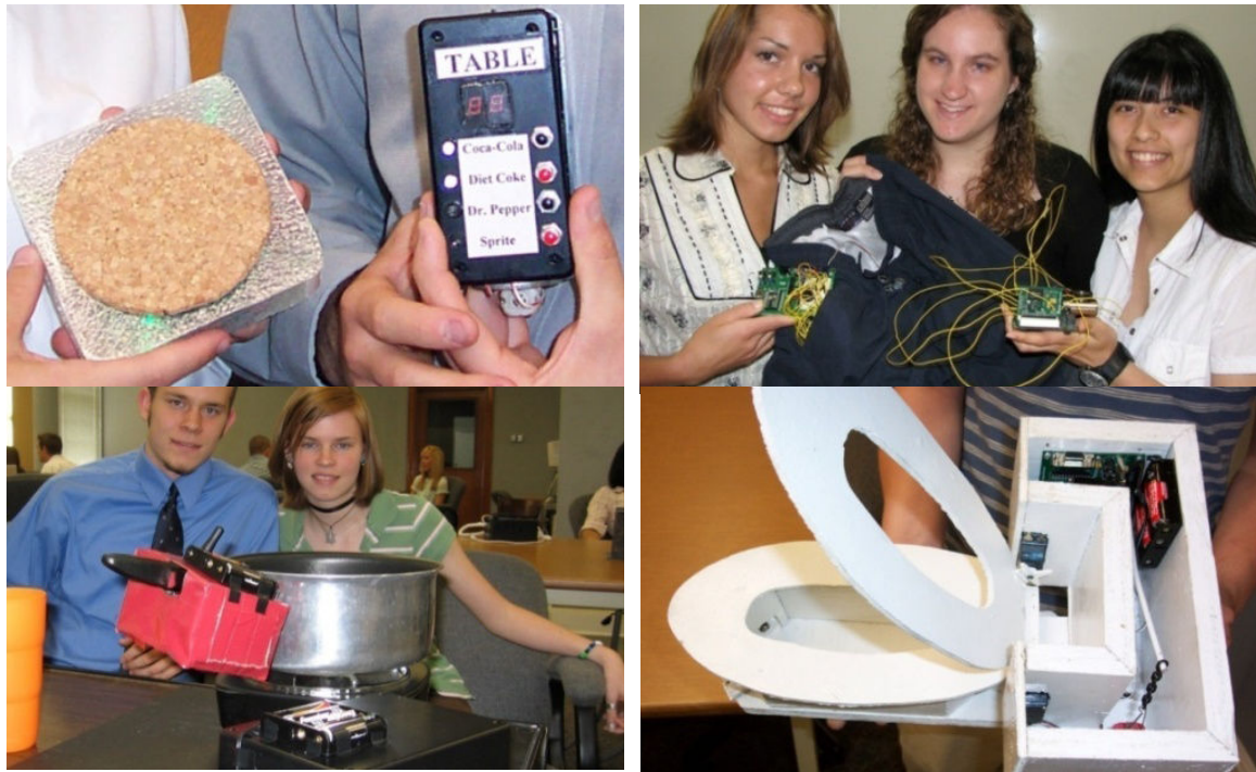
Figure 3. Top Left - RF coaster tells waiter to refill drink, Top Right – IR pants for object avoidance, Bottom Left – Smart Pot maintains constant temperature, Bottom Right – Clean Toilet for sanitary bathrooms.

Examples of student projects from previous Expos can be seen in Figure 3.