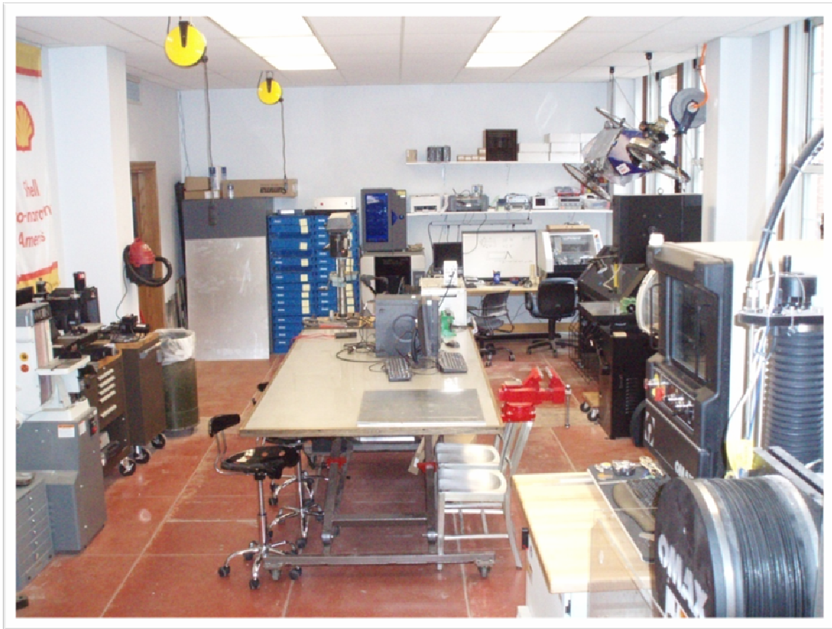
Figure 2. View of the Prototyping Lab at Louisiana Tech University.

Another component of the product development is that each design must incorporate some type of “smart” technology. While it may seem unnecessary to include electronics into every design, this decision was made in an attempt to push the students to create solutions on the systems level. Of course, these types of solutions are not ideal for every problem, but we believe that it is important for the students to have this experience. This decision does create at least one difficulty though. Some of the “smart” devices that the students use in their solutions can be expensive. In order to help the students create the best possible solutions, we have purchased a large supply of a variety of electronics including GPS modules, RFID tags and readers, accelerometers, CMU cameras, temperature probes, and many more items. These items have been packaged to work with the Parallax BOE-Bot used in the LWTL curriculum. As the students develop their ideas, they are allowed to check out these electronics for use in their projects if they do not want to purchase the items themselves. This does require a considerable amount of record keeping and management in order to assure that the parts are distributed and returned in a viable manner. Contracts are signed by the team members stating which parts are on loan and the students agree to replace the parts if lost or damaged.