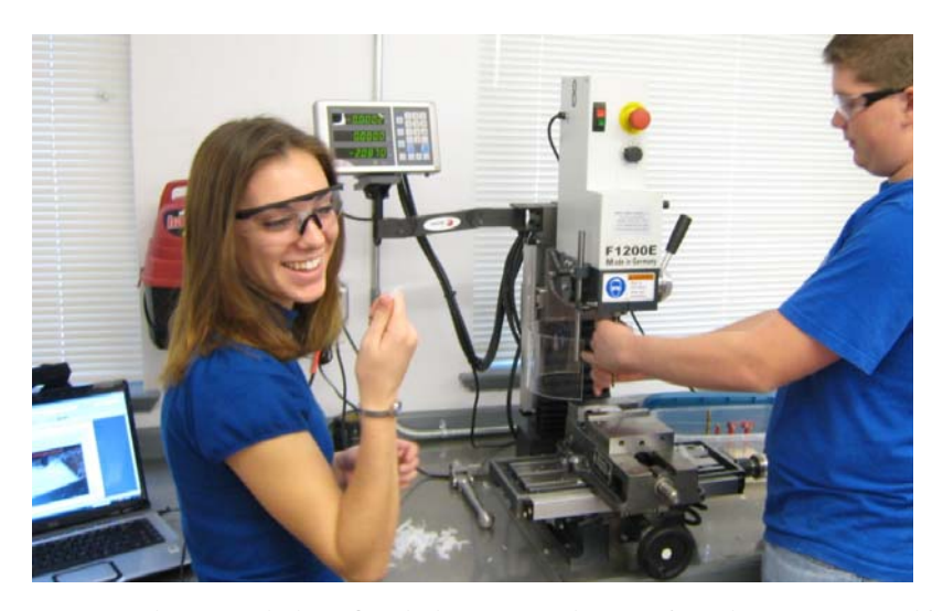
Figure 3. Students using a milling / drilling machine to fabricate a centrifugal pump.

Figure 2 shows the spacing of the milling / drilling machines. A single workstation with one of these machines is shown in Figure 3, along with a student who is working to fabricate the centrifugal pump, which is the project that drives the course content for ENGR 120.